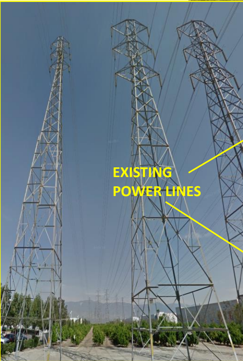
EXISTING POWER LINES