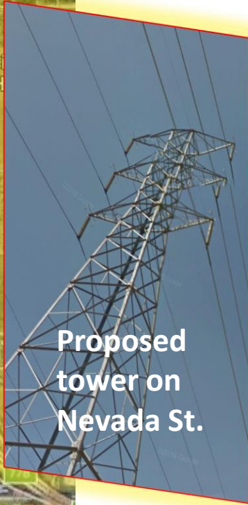
Proposed tower on Nevada St.